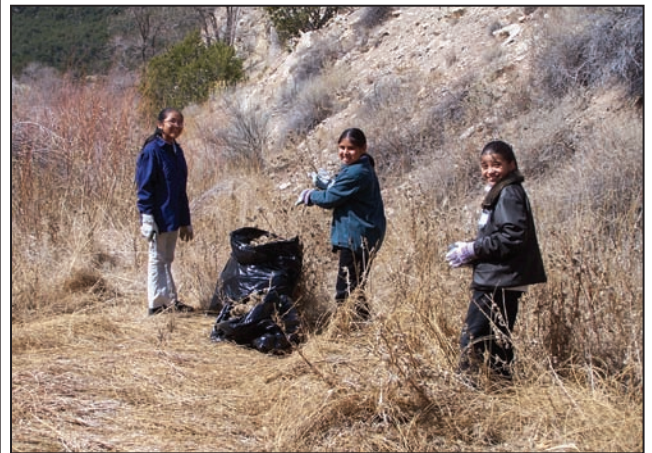
Students from Van Buren Middle School (MESA Program) help remove the invasive Bull Thistle from a section of Cedro Creek, March 16, 2006.

Cedro Creek is part of an EPA Wet Meadow Restoration Grant and we will be restoring about 9 miles of the creek over a 3 year period. Cedro Creek is located on south 337 in Tijeras Canyon east of Albuquerque. We will be holding a public work day on Earth Day, April 22, to restore a reach located close to the Sandia Ranger Station. We call this our X-Stream Makeover project that also involves local school children who have come out to help make a difference on Cedro Creek!