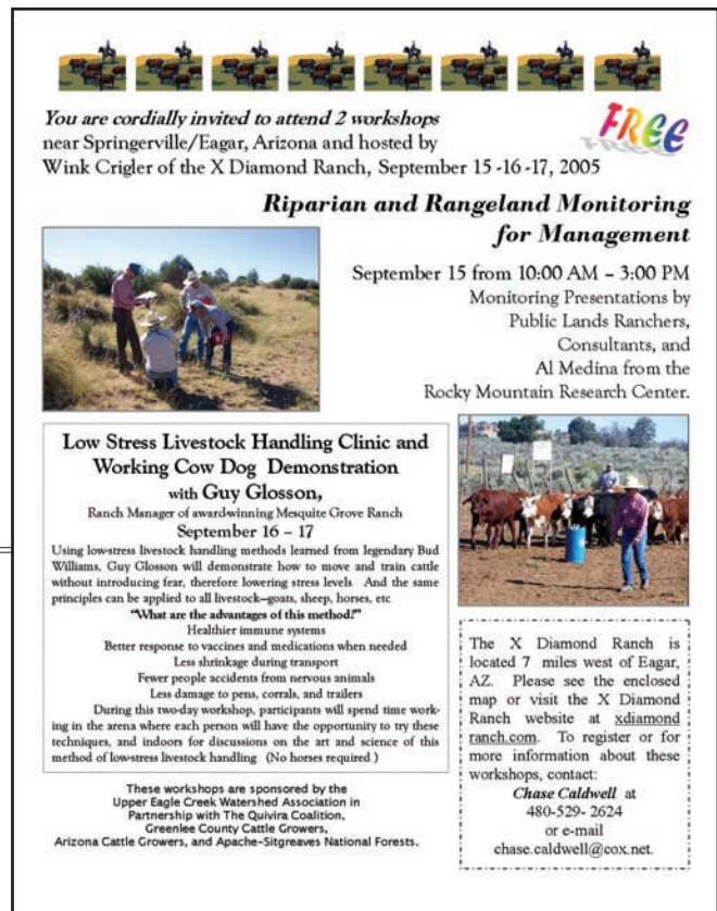
Example of a NRN Workshop Flyer

The USDA Forest Service Environmental Defense Public Service Company of New Mexico (PNM) and the Thaw Charitable Trust We appreciate their support!