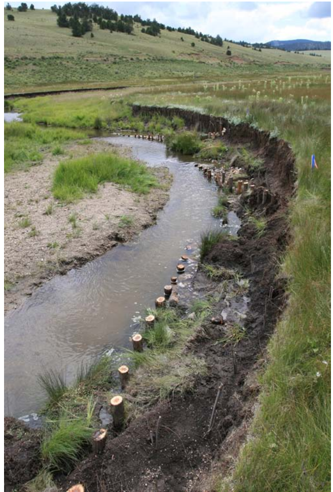
Three post vane structures help heal the creek by moving the water flow away from eroding banks on the outside bend (note the willow cutting planted behind the vanes, which will help build a new bankfull bench).

we hope to establish the technical and organizational foundation for achieving this goal and to begin some on-the-ground restoration at Comanche Creek to maximize habitat for the Rio Grande Cutthroat Trout.” In summer 2002, members of the working group conducted an assessment of the watershed, and then embarked on a three-pronged strategy to address impairments.