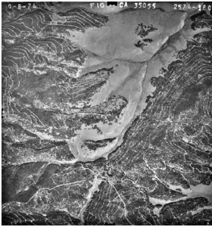
An aerial view of the upper Comanche Creek watershed taken in 1974 reveals the effects of hundreds of miles of logging roads.

the practical and the doctoring. They are words of redemption. . . . In other words, the restoration of health—to creeks, grasslands, ourselves—is a kind of moral exercise. I'm not sure that Bill Zeedyk, or any number of ranchers I know, looks at it quite in those terms, but I do.