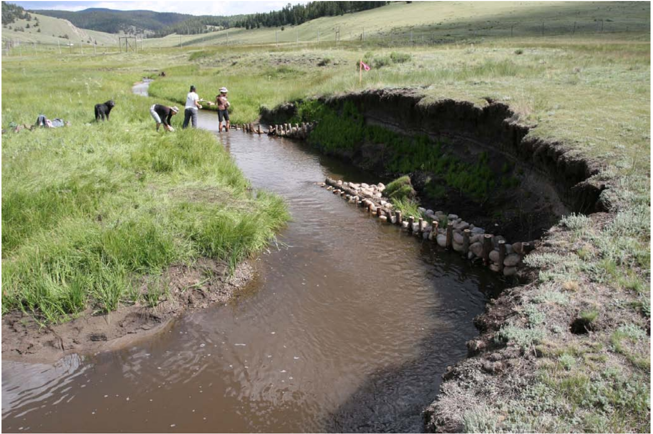
Volunteers use rocks to fill in behind a post vane structure in Comanche Creek (view upstream).

even an occasional volunteer cottonwood were growing steadily in the exclosures; culverts had been replaced; road scars were healing; and the creek itself was narrowing and deepening in places, which is a very good sign.