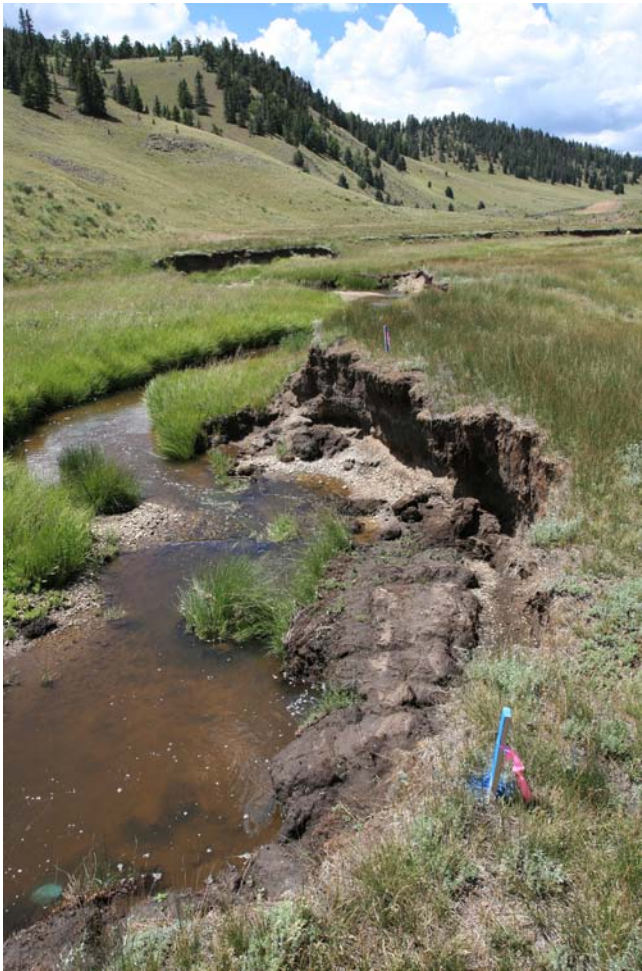
A legacy of heavy use in the Comanche Creek watershed has caused stream banks to become unstable, causing increased sedimentation.