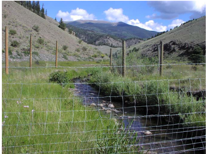
An herbivore exclosure under construction, one of fifty built since the mid-1990s to protect native vegetation along Comanche Creek.

At least I hoped his dream would come true. Was what we were doing on Comanche enough? I had no idea. I knew things were moving in the right direction on the habitat improvement front, thanks to our collective